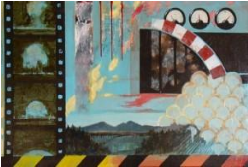
Los Alamos Bridge

The exhibition runs through November 12, 2016.