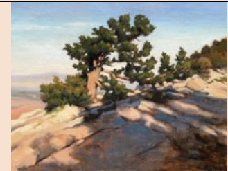
On Edge (2016) - Oil, 11"x14"