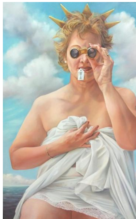
Liberty , oil on linen

at our society. The price tag speaks to the money spent on our political process.