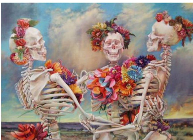
Jubilee , oil on linen