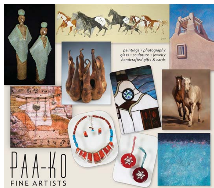
Above: PAA-KO FINE ARTISTS SHOW (See Notice in this issue)