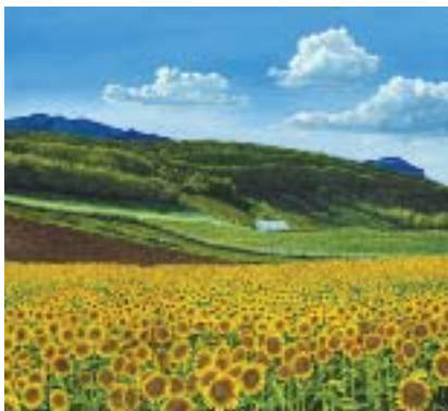
Sunflowers in Provence