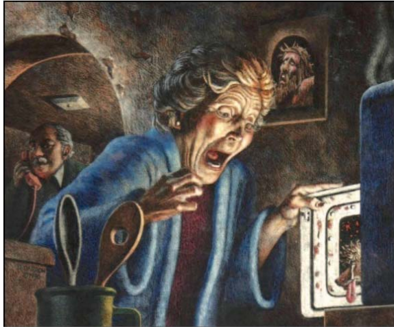
The demise of Poopsie by Rex Barron